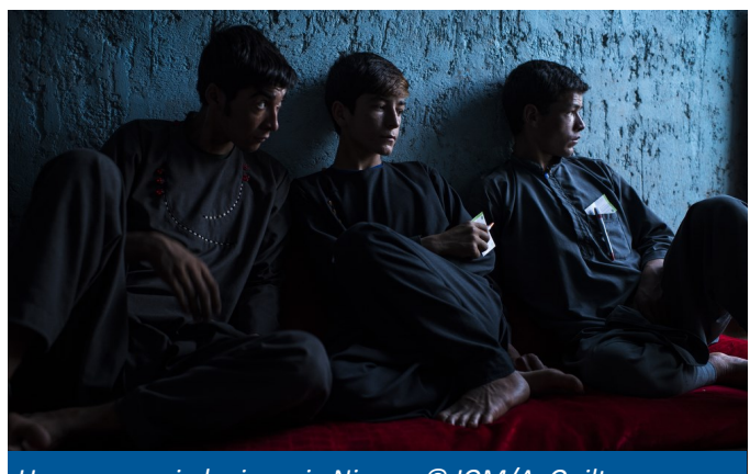
Unaccompanied minors in Nimroz

as a result of Ramadan. The fall in return figures is a reflection of the ongoing political transition in Pakistan. Presently a caretaker government is in place until 25 July when new federal elections will be held. The result of these elections could have major implications for Afghans living in Pakistan.