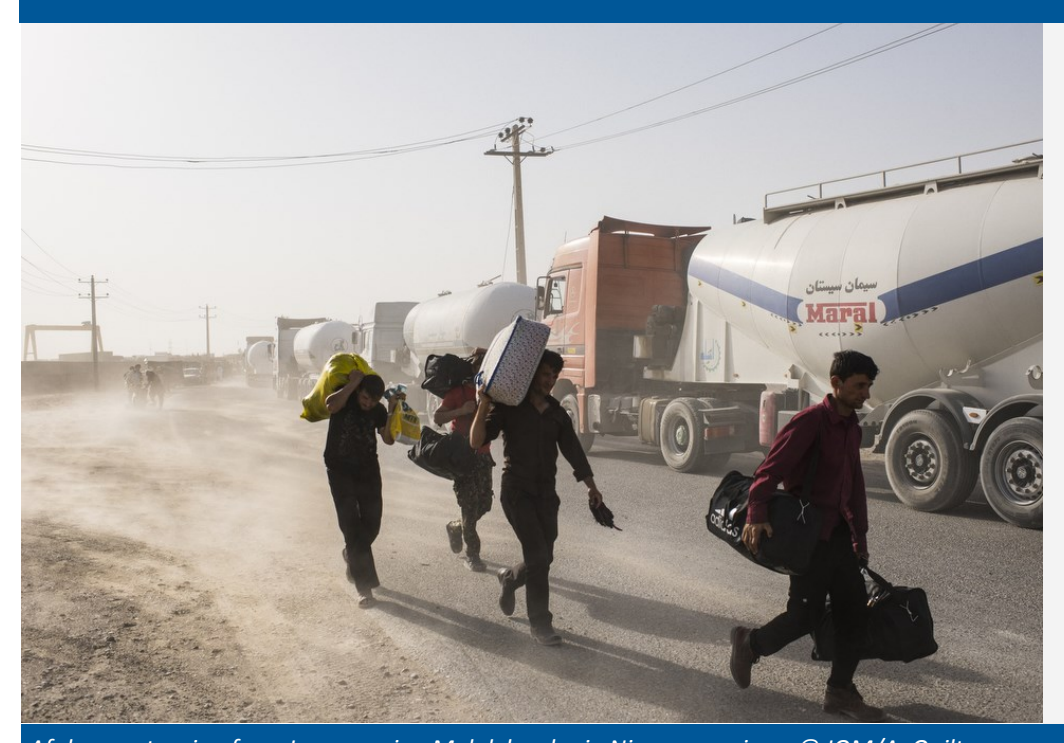
\textit{Afghans returning from Iran crossing Melak border in Nimroz province.} \ \ \textbf{@} \ \textit{IOM/A}. \ \textit{Quilty}