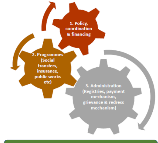
4. Evidence base