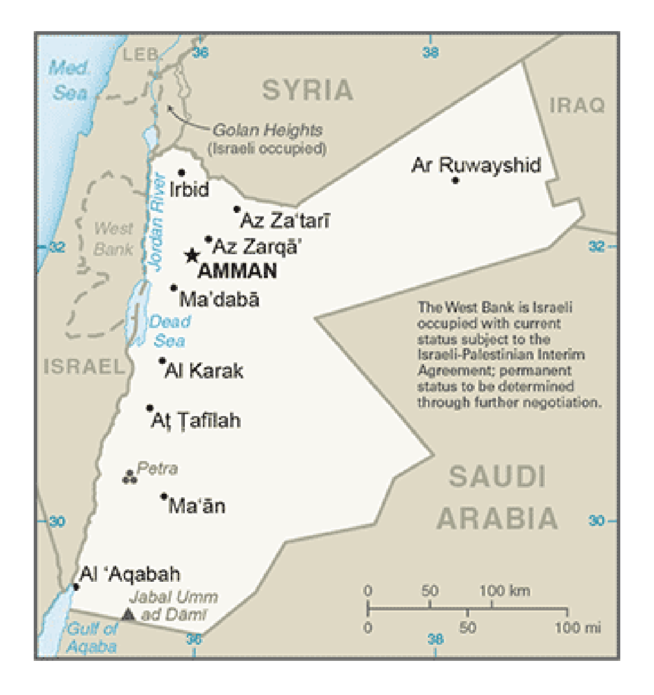
Map 1. Map of Jordan and location of Za'atari Camp