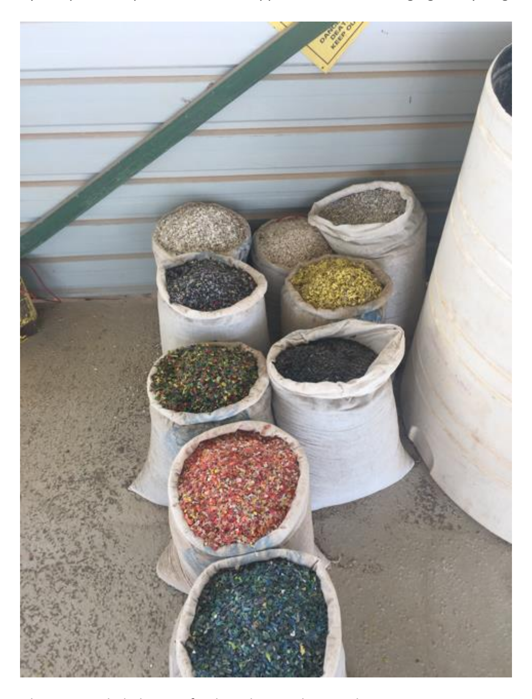
Photo: Recycled plastic – final product at the recycling centre in District 11

In total, both recycling centres provide 201 CFW opportunities in 3, 6, or 12-month rotations. Oxfam also provides on-the-job training including work place Health & Safety and position specific technical support related to managing a recycling centre.