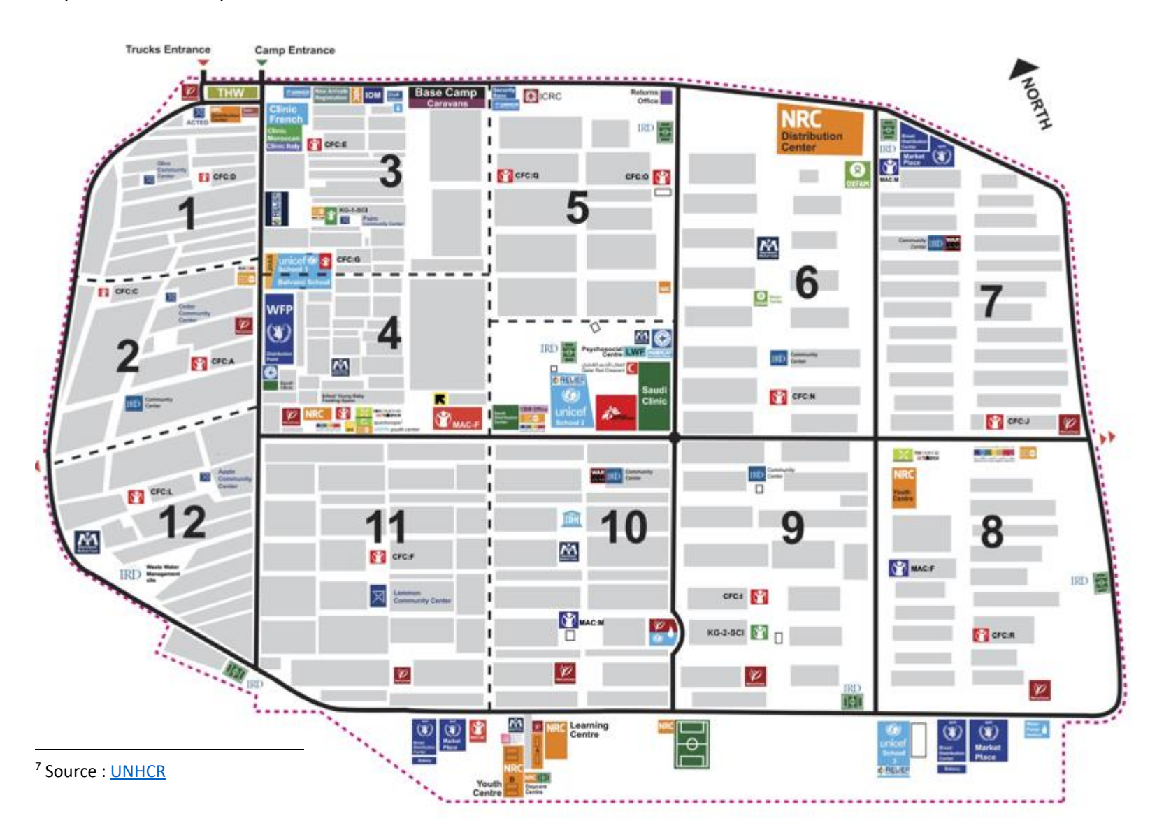
Map 1. Za'atari Camp<sup>7</sup>